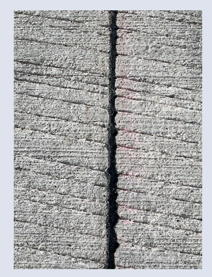
Figure 5 Properly Filled Narrow Joint

It is recommended that the sealant be flush filled with the surface as indicated in Figure 5 which indicates a properly filled joint. It has been demonstrated that a flush filled hot pour installation can last twice as long as a recessed installation (1).