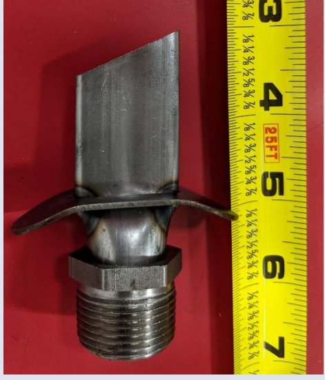
Figure 6 Special Installation Tip -Side View

Although manufacturer dependent, tracking should not occur until pavement temperatures exceed 150° F. Concrete pavements rarely exceed 135° F.