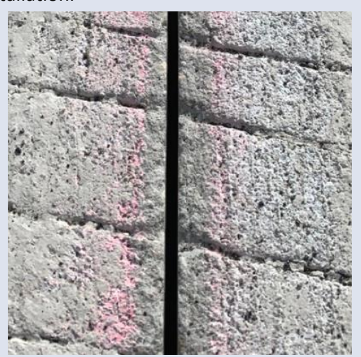
Figure 4 Photo of Media Blasted Joint

Figure 4 is a joint ready for material installation.