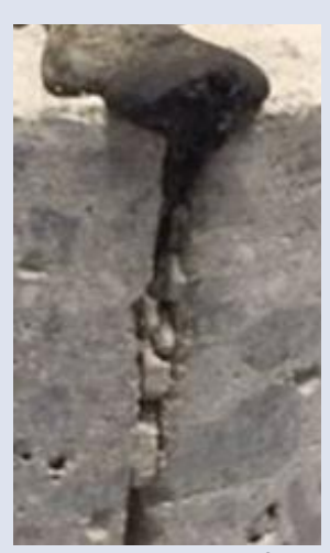
Figure 2 Field Core Retrieved from 1/8" Joint

Estimates of the joint opening widths can easily be determined using the ACPA "Joint and Sealant Movement Estimator". The ACPA also has a Joint Noise Estimator app. Both apps are available at the App Library at www.acpa.org.