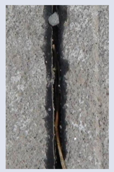
Figure 8 Unsatisfactory Filled Joint