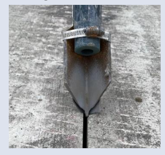
Figure 3 Media Blast Alignment Fixture

Most media blast procedures recommend that two passes be made (one for each side). However, a more typical approach for narrow joints is a single pass with an alignment fixture (See Figure 3). It should be remembered that the goal is to media blast the top two inches of the joint walls to provide good bond throughout the filled area.