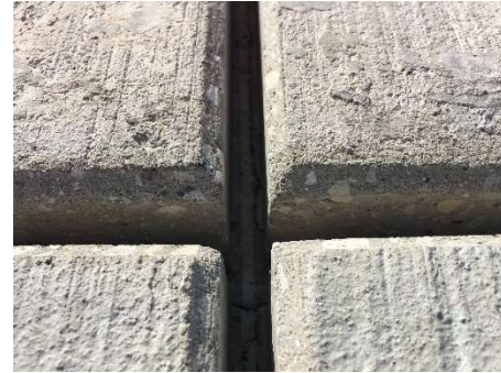
Figure 8 Airfield Joints are Typically Wider and Have Beveled Sides

allowing better access for power washing and media blasting (See Figure 8).