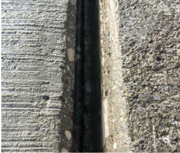
Figure 6 Joint Cleanliness After Power Washing

In Figure 7, the dust cloud from the media blasting indicates the additional slurry laitance that is being removed by the media blasting even after power washing. The media blasting also provides additional texture to the side walls providing better bonding.