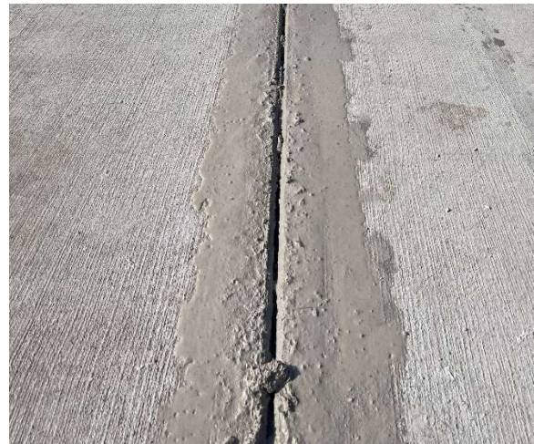
Figure 5 Indicates Slurry Produced from a Reservoir Cut

Care must also be exercised in not leaving excess slurry on the pavement surface that can become airborne from other construction operations causing OSHA compliance issues.