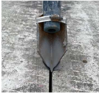
Figure 1 Media Blast Alignment Fixture

Initial sawing (contraction joint sawing) occurs soon after concrete placement and its purpose is to prevent random cracking of the pavement. Typically, walk-behind saws are used with down cutting blades. Wet sawing is still the most common process and is the focus of this Tech Brief. Early entry sawing is a different process and may require a different approach.