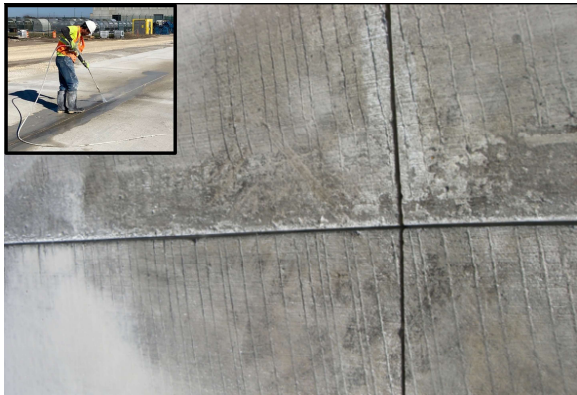
Figure 4 Example of Properly Power Washed Joints