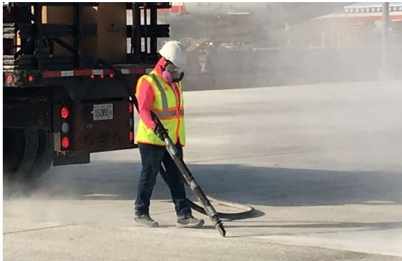
Figure 7 Additional Saw Slurry Removal Through Media Blasting

In Figure 7, the dust cloud from the media blasting indicates the additional slurry laitance that is being removed by the media blasting even after power washing. The media blasting also provides additional texture to the side walls providing better bonding.